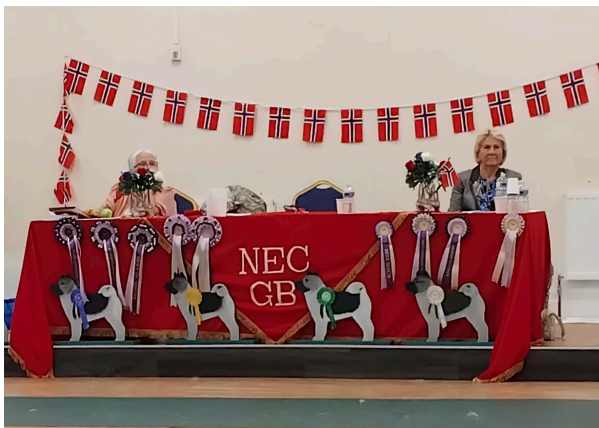
The Club Table & all important refreshments