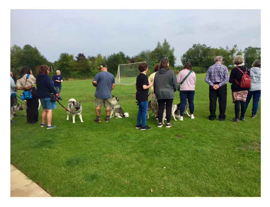
The "Have A Go" queue