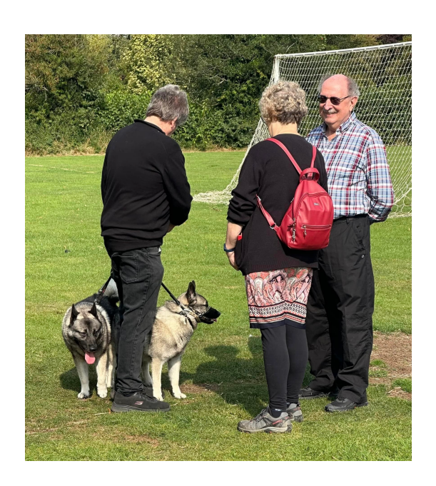
Some general photos of the day